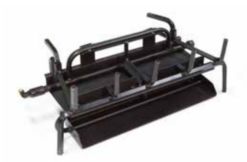
Available Sizes: 18", 24", 30", 36" and 42" Item # 3BRN-##