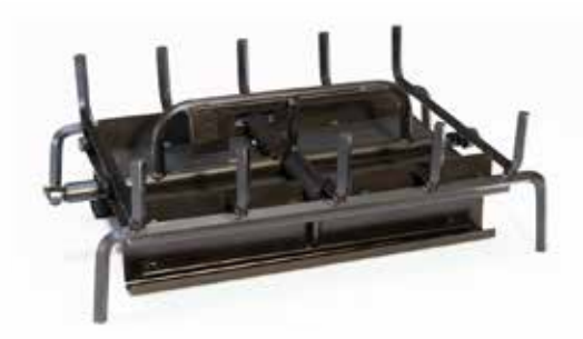
Available Sizes: 18", 21", 24", 30", 36" and 42" Item # 3BRN-ST##