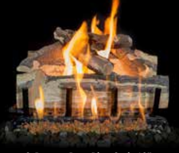
2-Burner Blue Pine Split 18"