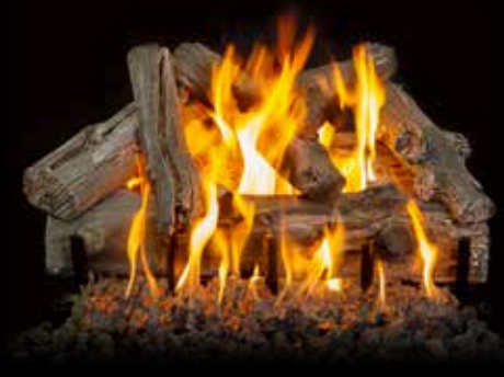
2-Burner Arizona Western Driftwood 24"