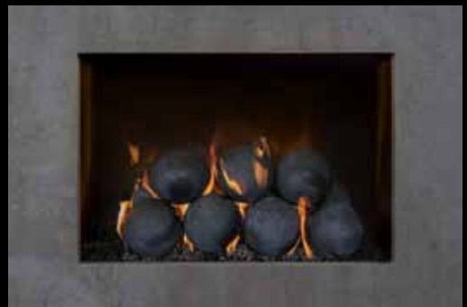
Fireplace Fiber Cannonballs