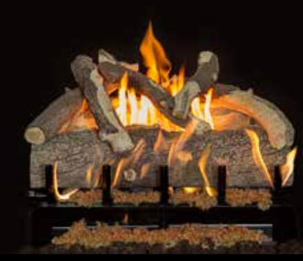
3-Burner Blue Pine Split 24"