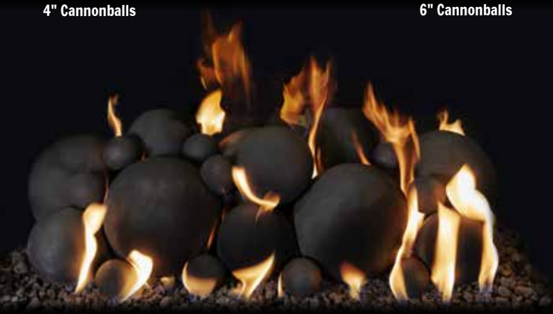
2", 4" and 6" mixed Cannonballs