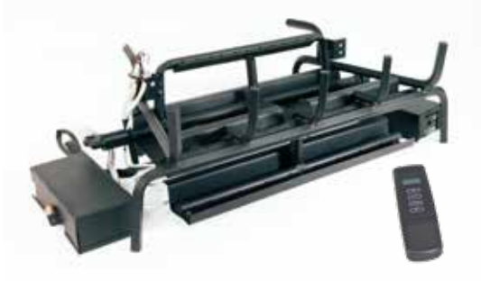
Assembled burner propane with battery electronic and remote system. 3BRN-##-**-MVKEI-GCRK