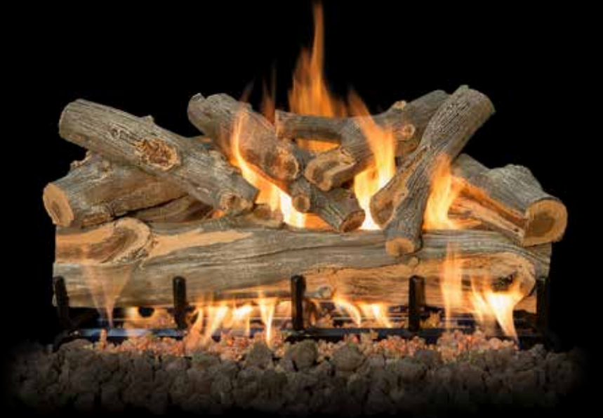
2-Burner Arizona Juniper 30"