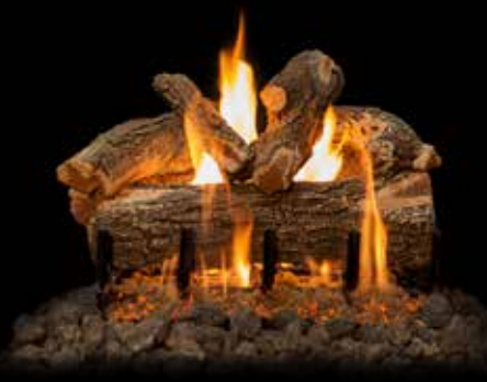
2-Burner Arizona Weathered Oak 21"