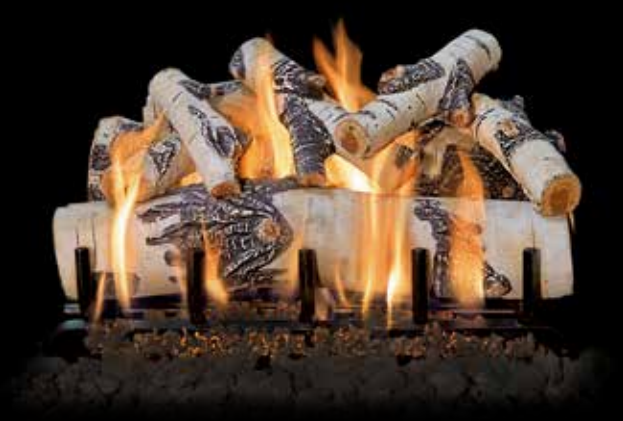
2-Burner Quaking Aspen 24"

Quaking Aspen Collection Here is Grand Canyon Gas Logs' signature birch set. This traditional birch log set balances the cream whites with the scarred black bark from the winter snows. Item # ASPEN##LOGS