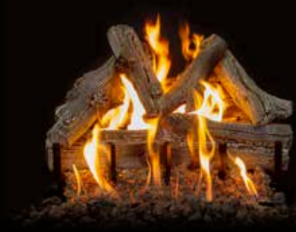
2-Burner Arizona Western Driftwood 21"