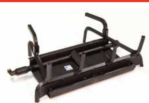
Available Sizes: 18", 21", 24", 30", 36", 42", *48" and *60" Item # 2BRN-## * Height of a 3 burner