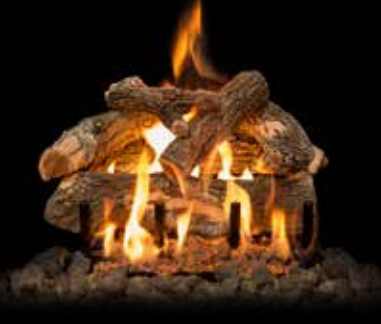
2-Burner Arizona Weathered Oak 18"