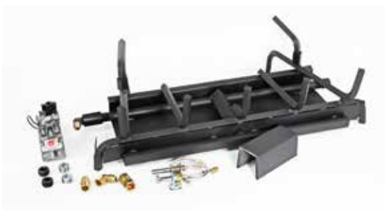
Assembled burner natural gas with millivolt and remote system. 2BRN-##-**-MVK-GCRK