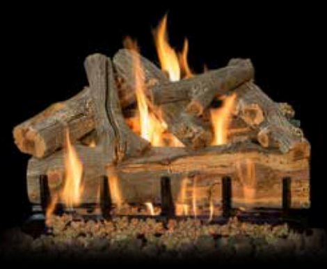
2-Burner Arizona Juniper 24"