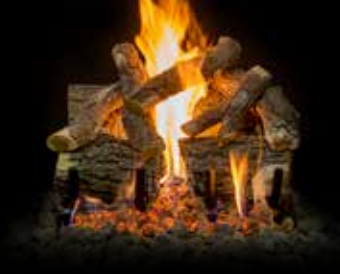
2-Burner Arizona Weathered Oak Charred 18"

Arizona Weathered Oak Charred (AWOC) Available in 18", 24", 30", 36" and 42". Front View and See-Through. Burner compatibility 2 and 3 burner.