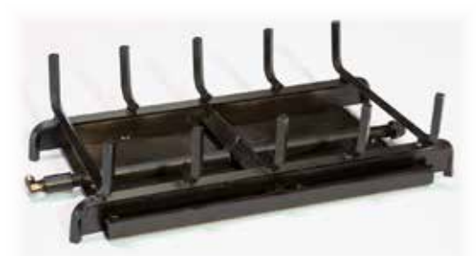
Available Sizes: 18", 21", 24", 30", 36", 42", 48" and 60" Item # 2BRN-ST##