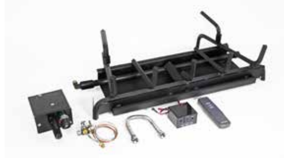
Assembled burner natural gas with modulating millivolt and remote system. 2BRN-##-**-MMVR