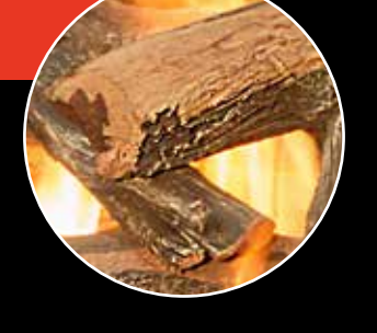
Arizona Juniper (AJ) Available in 18", 21", 24", 30", 36" and 42". Burner compatibility 2 and 3 burner.