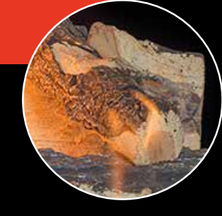
Blue Pine Split (BPS) Available in 18", 24" and 30". Front View only. Burner compatibility 2 and 3 burner.