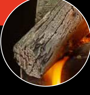
Arizona Western Driftwood (WD) Available in 18", 21", 24", 30", 36" and 42". Front View and See-Through. Burner compatibility 2 and 3 burner.