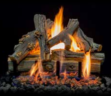
2-Burner Arizona Juniper 21"