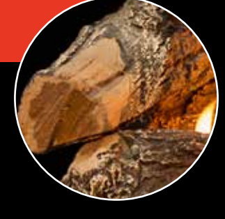
Arizona Weathered Oak (AWO) Available in 18", 21", 24", 30", 36", 42", 48" and 60". Front View and See-Through. Burner compatibility 2 and 3 burner.