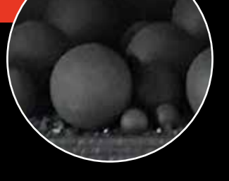
Fireplace Fiber Cannoballs Available in 2", 4", and 6".