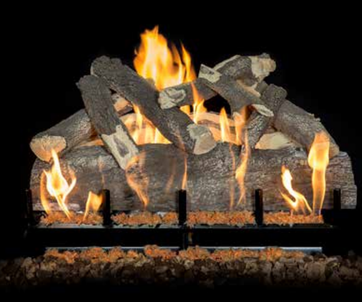
3-Burner Blue Pine Split 30"