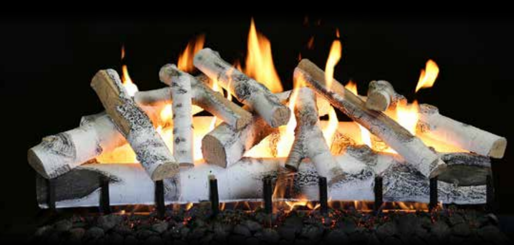
2-Burner Quaking Aspen 42"