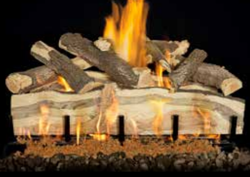
2-Burner Blue Pine Split 30"