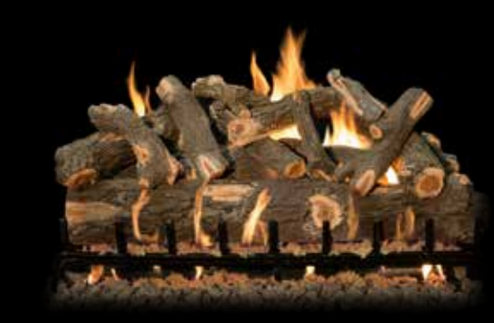
3-Burner Arizona Weathered Oak 42"