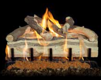
2-Burner Blue Pine Split 24"