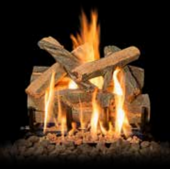
2-Burner Arizona Juniper 18"