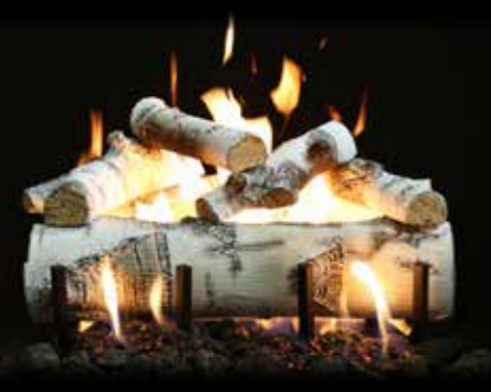
2-Burner Quaking Aspen 18"