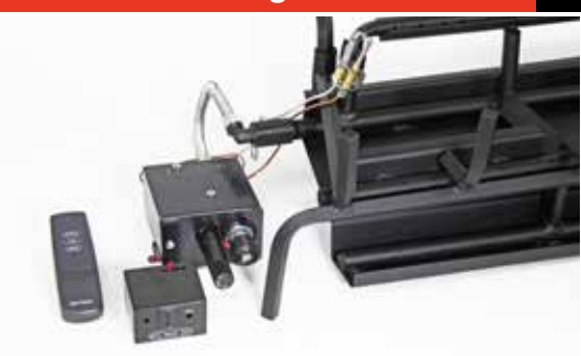
Assembled burner natural gas with modulating millivolt and remote system. 3BRN-##-**-MMVR