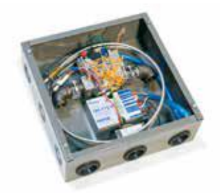
200K Natural Gas BTU Rating 320K Propane BTU Rating Item # EIS