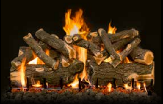
3-Burner Arizona Weathered Oak Charred 36"

3-Burner Arizona Weathered Oak Charred 42"