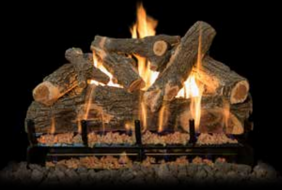
3-Burner Arizona Weathered Oak 30"