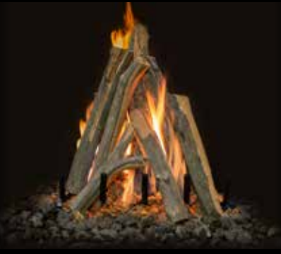
Kiva Arizona Juniper (AJ)