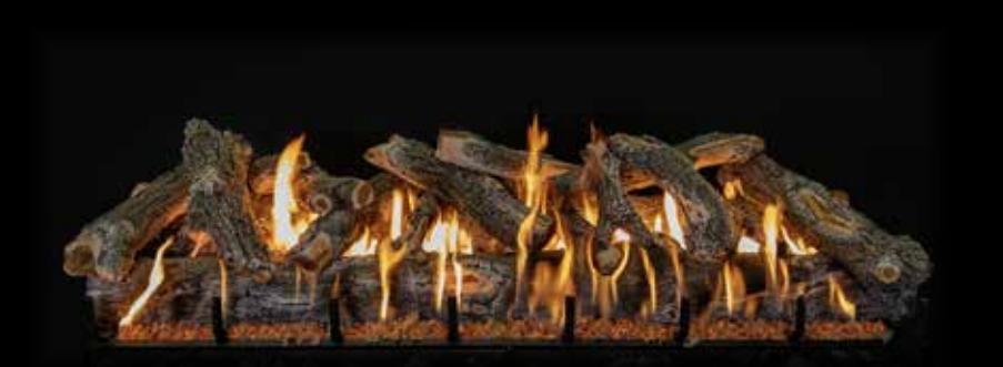
2-Burner Arizona Weathered Oak 60" Also available in 48"