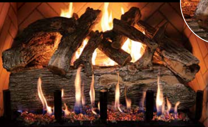
Jumbo-Burner - Jumbo Arizona Weathered Oak 36"