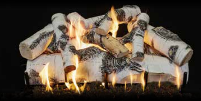
2-Burner Quaking Aspen 30"