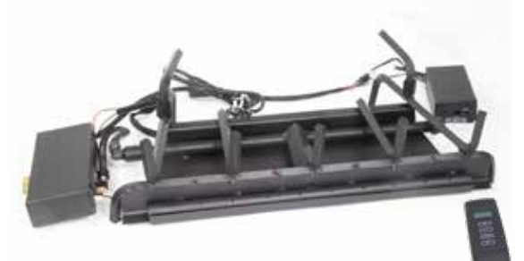
Assembled burner natural gas with battery electronic and remote system. 2BRN-##-**-MVKEI-GCRK