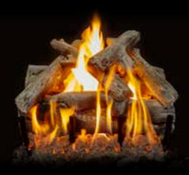
2-Burner Arizona Western Driftwood 18"