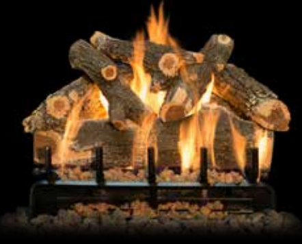
3-Burner Arizona Weathered Oak 24"