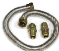
Flex line & Fittings