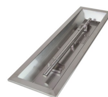
Burner & Pan Options