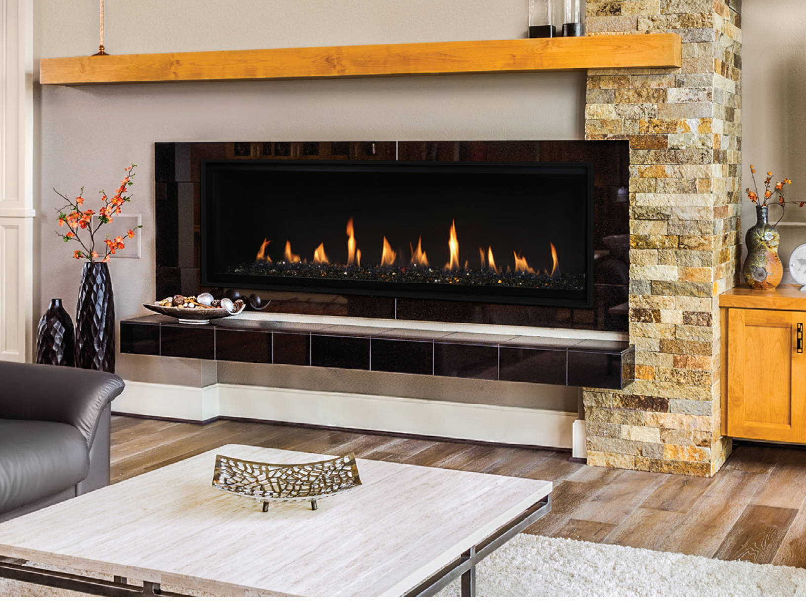
FEATURED DRL4060 shown with black painted interior and black reflective crushed glass