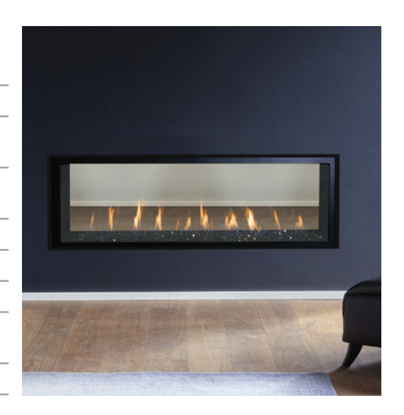
DRL4060 shown with see-through kit and black reflective crushed glass