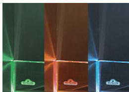
LED Lights x3