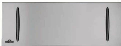
Stainless Steel Cover