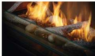
Driftwood Media Kit