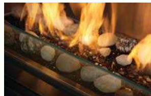
Mineral Rock Media Kit