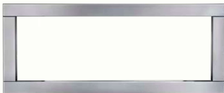
Stainless Steel Trim