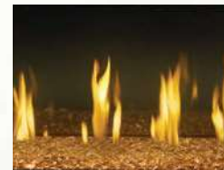
Topaz Ember Bed (Included)