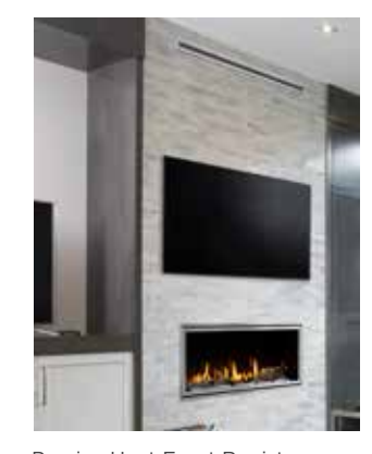
Passive Heat Front Register