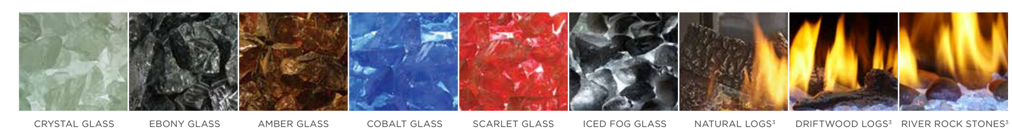
1: Not available for 72-inch model 2: Quattro Front available in black and new bronze only. Loft Forge front available in hammered steel only. 3: Requires glass media