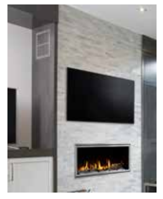
Passive Heat Side Register