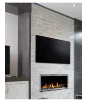
Passive Heat Open Wall Register (opening 2" from ceiling)