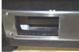
Without Firebox Divider