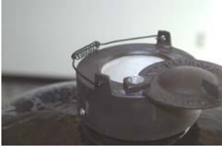
With Firebox Divider