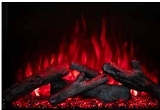
Red Flames - Logs off