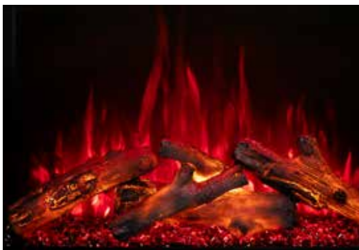
Red Flames - Logs on