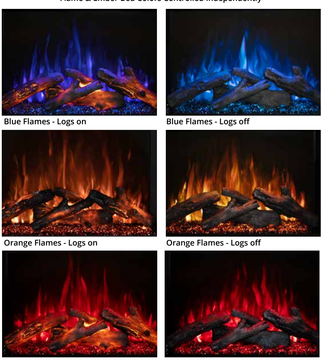
Red Flames - Logs on Red Flames - Logs off