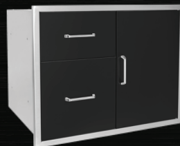
DOOR / DRAWER COMBO 30" X 24" 304 BLACK STAINLESS