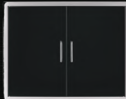
DOUBLE DOOR 38" X 24" 304 BLACK STAINLESS