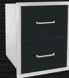
DOUBLE DRAWER 16" X 22" 304 BLACK STAINLESS