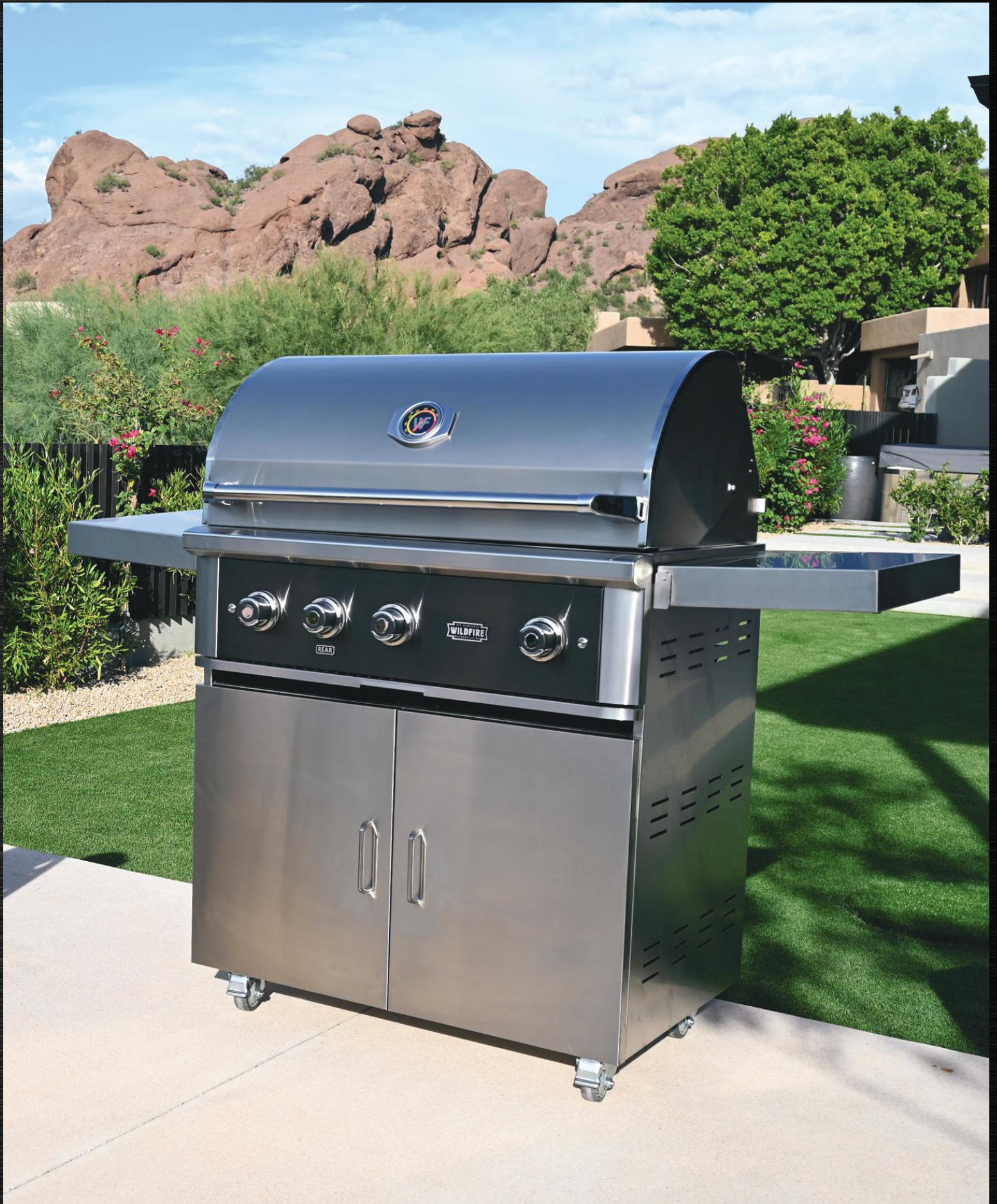
36" GRILL with STAINLESS STEEL CART WF-PRO36G-RH and WF-CART36-CGG