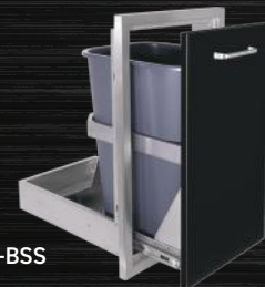
PULL OUT TRASH DRAWER 14" X 26" 304 BLACK STAINLESS