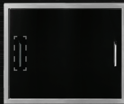
HORIZONTAL SINGLE DOOR 27" X 20" 304 BLACK STAINLESS