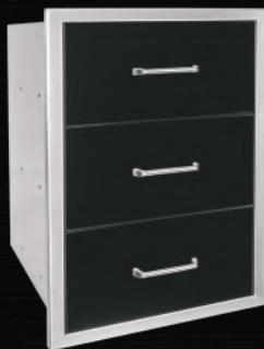
TRIPLE DRAWER 19" X 26" 304 BLACK STAINLESS