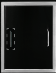
VERTICAL SINGLE DOOR 16" X 22" 304 BLACK STAINLESS

From black stainless steel doors and drawers to built-in ice chests and outdoor refrigeration – Wildfire's accessories have everything you need to transform your outdoor kitchen into an entertaining oasis.