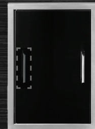
VERTICAL SINGLE DOOR 20" X 27" 304 BLACK STAINLESS