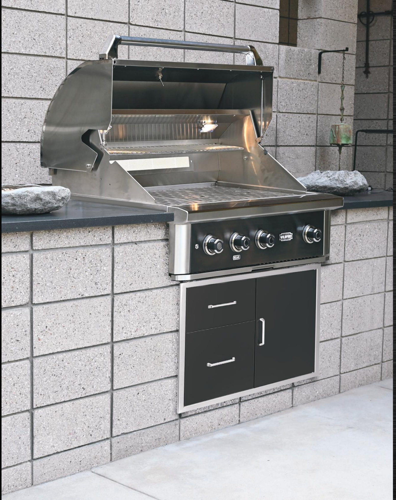
36" GRILL with DOOR / DRAWER COMBO 30" x 24" RANCH WF-PR036G-RH-(NG/LP) and WF-DDWC0MB03024-BSS